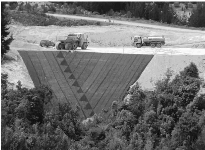
Enkamat placed on batter by Chaytor Road