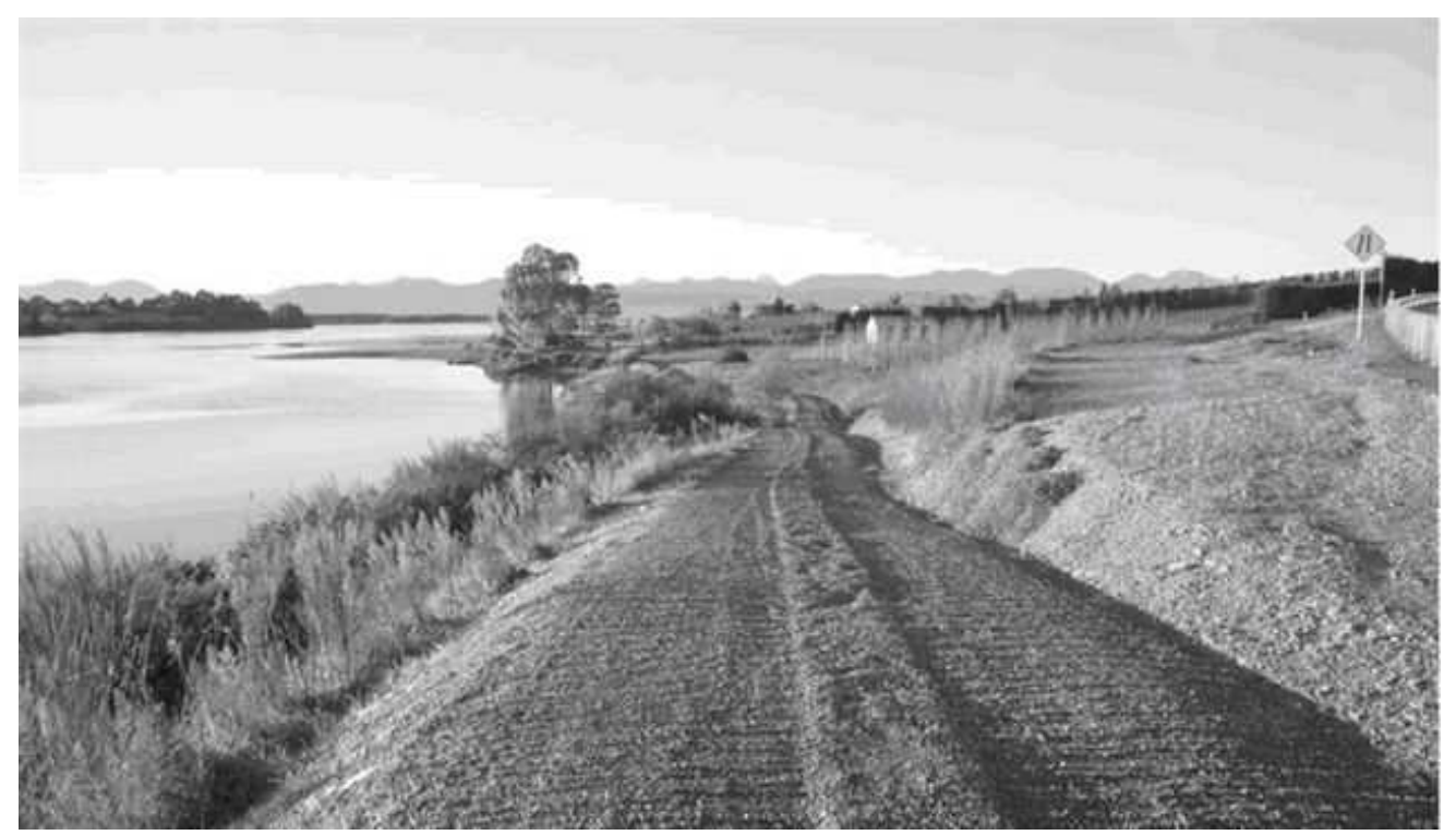
The new council-built walkway near Apple Valley Road. Critics say that it looks more like a road than a path and that it is too close to the estuary edge.