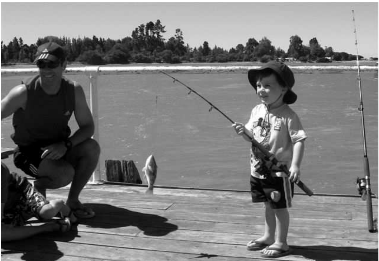
Fishing success - Mapua Wharf

"Club Mapua is a not-for-profit organisation based in Mapua. The club has been established as a community social club to organise social events with the aim of raising money for community projects."