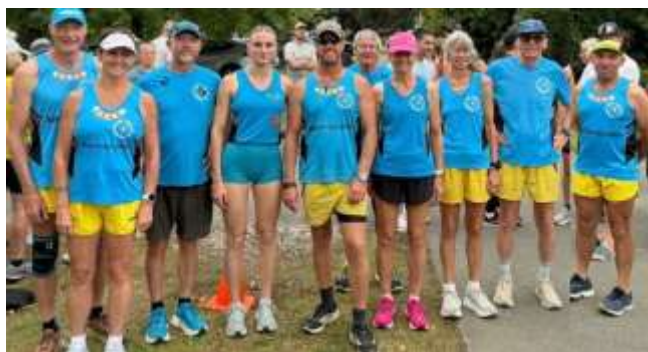
Runners at the Milnes Beatson Wakefield Roaster

We also had some runners take part in events at The Spectacle in Nelson. The Spectacle involves a variety of road and trail running events of varying distances and attracts a lot of competitors from outside the region. Well done to everyone who took part.