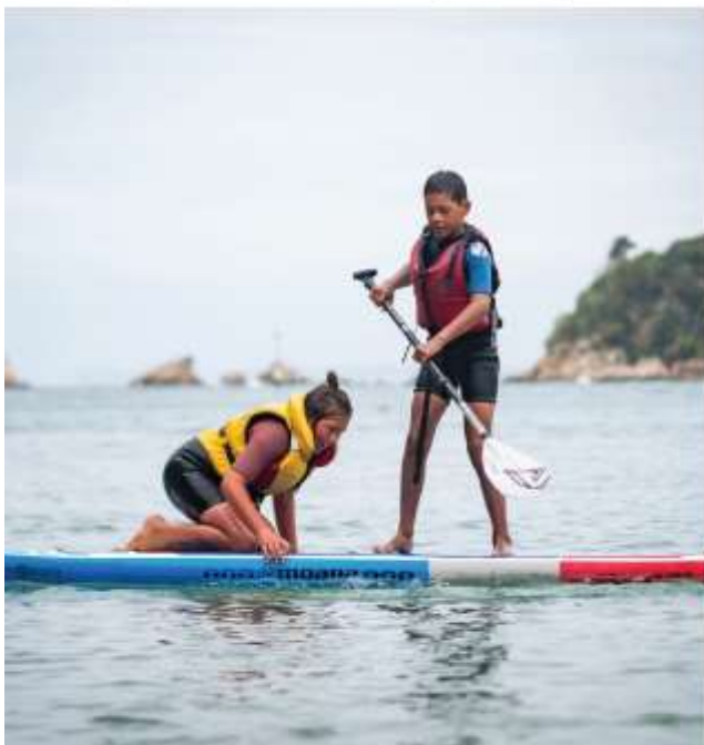
Parklands School beach day with paddle boards

This partnership was supported by Ministry of Education, Te Rau Puawai, Sport Tasman, and Te Pūtahitanga o Te Waipounamu.