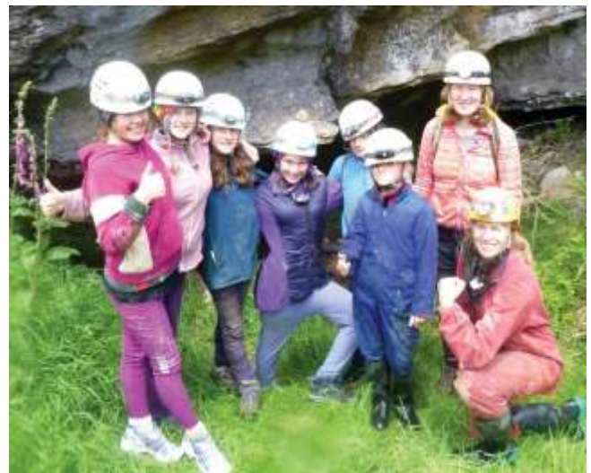
If you're lucky you might go caving on a Whenua Iti Outdoors holiday programme.