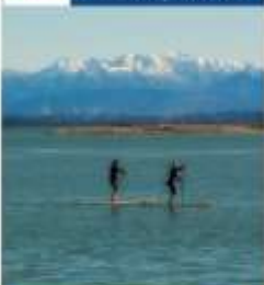
Mapua | Ruby Coast | Moutere Hills

We're excited to announce the new 2020 MDBA Business Directory which we'll be rolling out early next year. Watch this space!