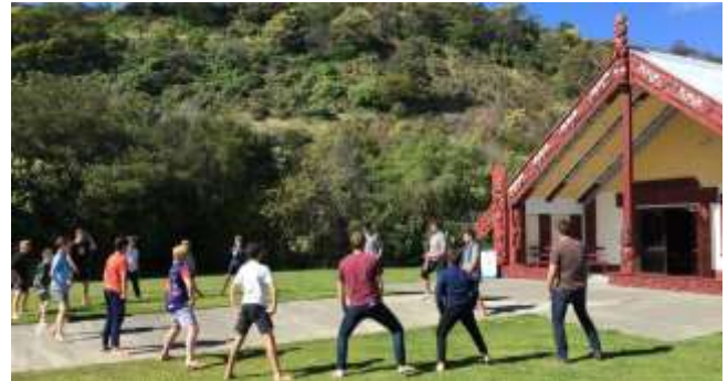
Manaaki Tāpoi students teach a new haka to Māpua school children